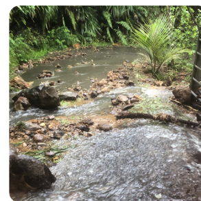
Debris inundation 2 Deposit of other items (e.g. rocks, fallen trees and destroyed fences)