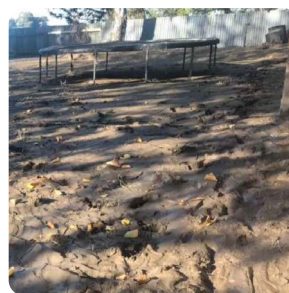
Silt inundation Deposit of soil and sand

Silt and debris inundation is commonly caused by materials that are swept up and moved by water and/or wind during a storm or flood and are deposited and remain on any insured residential land.