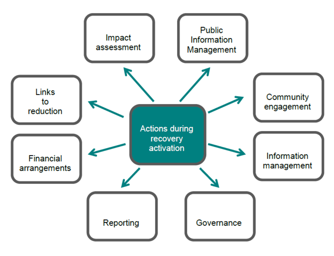
Figure 5.1 Actions During Recovery Activation

The key components of "Actions during recovery activation" are shown in Figure 5.1 below: